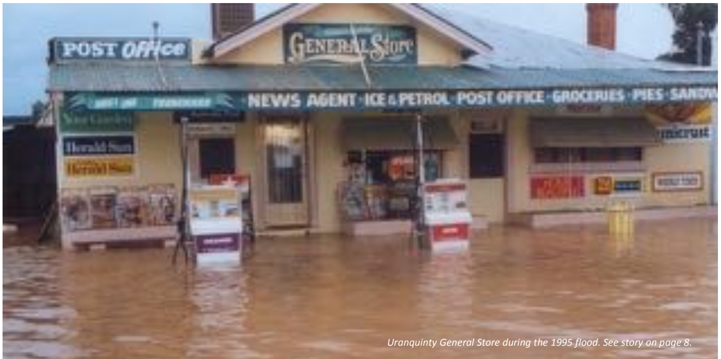
Uranquinty General Store during the 1995 flood. See story on page 8.