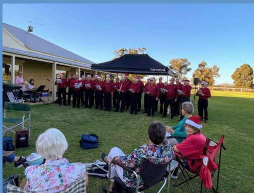
Carols at the Oval, Saturday 4 December

Left: Santa arrives in Uranquinty RFS fire truck