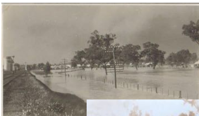
the bridge at the western end of the town was washed away and the water coming down the main street was over half a metre in

November 1914: Torrential rain fell in the vicinity of the village and a deluge of water came down beside the railway line and the main road and the township was nearly all under water. Two years later floods again surged through the village.