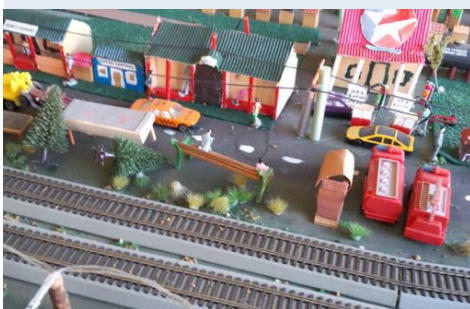
Fred Velthuis' amazing model railway on display at the Mens Shed during the annual Village Garage Sale in October.