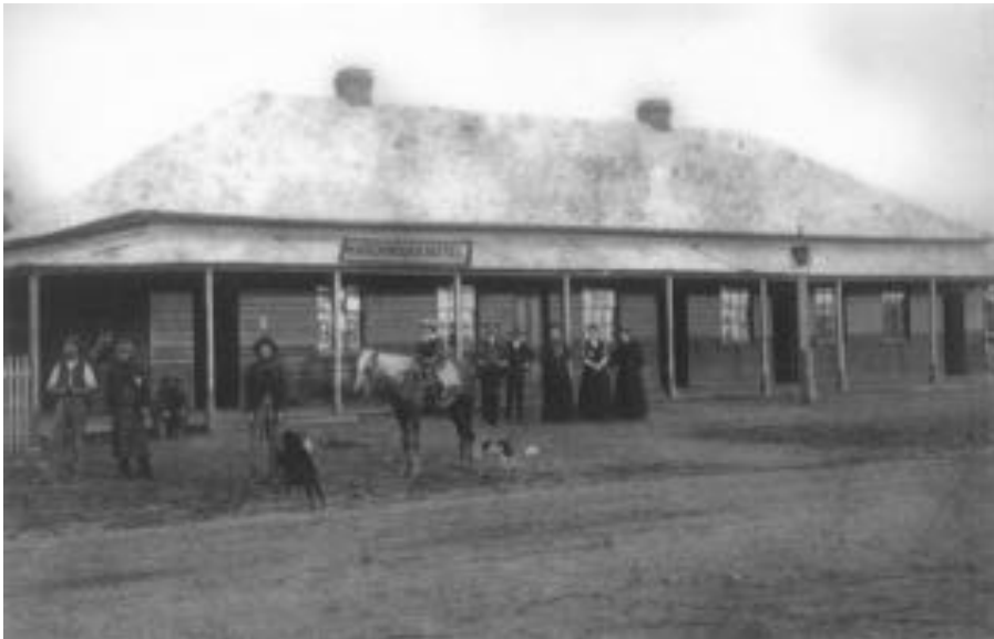
From top to bottom Hardiman's Hotel built in 1890; Uranquinty Hotel before renovations in 1925; the current hotel before re-painting in 2022