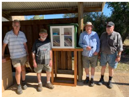
Members of the Men's Shed crafted a book cabinet for the Community Street Library now open at Wirraway Park.

Our monthly meetings are now to be held on the last Saturday of each month. The meetings commence at 12 noon and are followed by a BBQ and social afternoon. All are welcome.