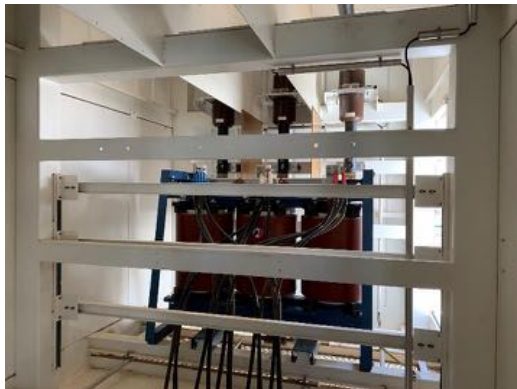
Picture: UPS Auxiliary Transformer

Our site team, with support from engineering personnel and multiple local contracting firms, are completing test and maintenance works on our high voltage equipment. This work ensures systems are in good condition, for optimum performance and to protect them in the unlikely event of a failure.