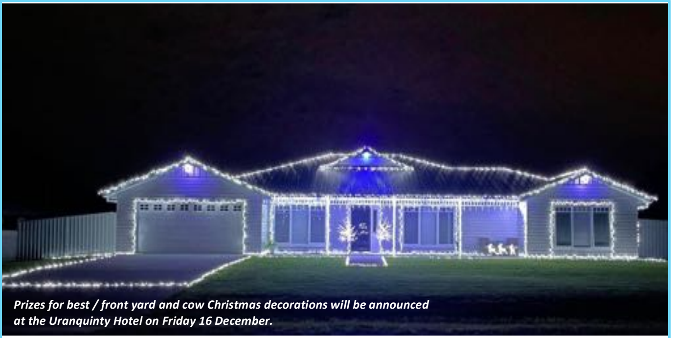
Prizes for best / front yard and cow Christmas decorations will be announced at the Uranquinty Hotel on Friday 16 December.