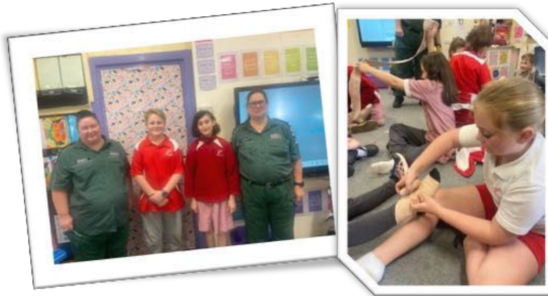
Picture: Students and trainers delivering First Aid skills to Uranquinty Public School students.

We also look forward to further supporting the wider community and would love to hear from you if there are community activities or initiatives you think we may be able to support.