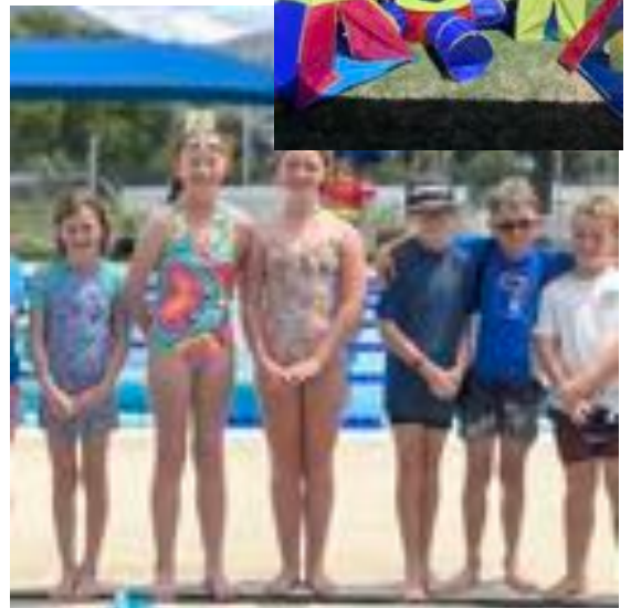
Age Champions above; Small School Age Champions at right..