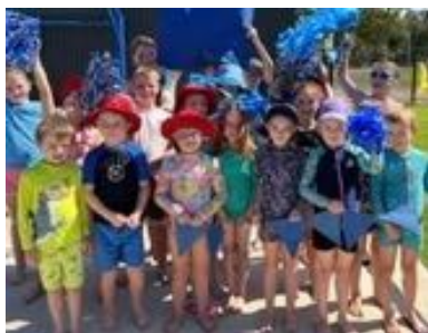
Clockwise from top: Our new Kinders; Kinder art; Kookaburras and Rosellas.