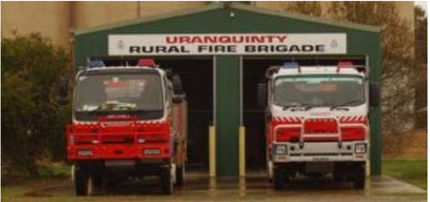
Without more volunteers for our Rural Fire Brigade, a local Uranquinty fire may become disastrous while fire trucks arrive from Wagga. See story on page 11