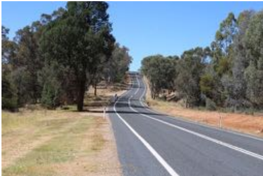
After years of local action, Dunns Road has finally been opened to the public after a substantial upgrade. Read more on page 11.