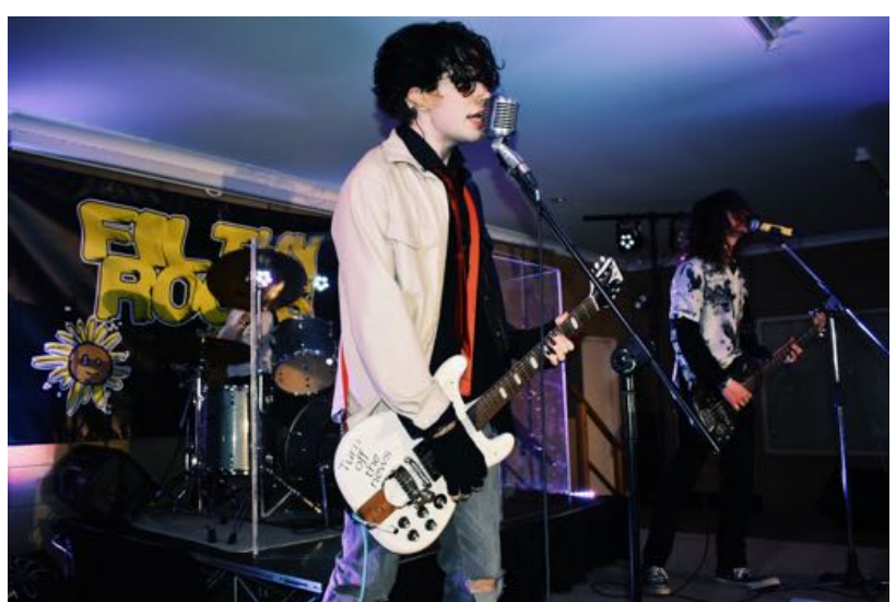
Top: The Whicklock Irish Group played to a packed house at the Hall in the third annual free Riverina Conservatorium of music concert. Below: Filthy Rocks played a free concert, sponsored by Wagga Council.