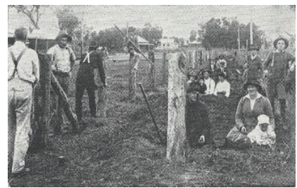
Above: Original Yarragundry/Morgan Street War Memorial dedication in 1919. (Credit: Australian War Memorial). Below: Avenue of trees being planted in Pearson Street, 1918.

was taken over by Wagga Wagga City Council and they also informed the Village that the Road would be upgraded and a service road constructed for Morgan Street local traffic. After much discussion on a future site for the memorial and the RSL being most reluctant to move the monument from its consecrated position on the corner, it was decided that the most suitable site would be next to the proposed Ted Jeffery Oval, now the site of the Men's Shed. In 1985 the memorial was placed in temporary storage at Wagga Wagga City Council's works depot. Many dates were organized for the removal and rededication but passed without any action. A site was finally chosen in the car park of the Neighbourhood Centre so, on 9 August, 1987, the monument was rededicated. When Wirraway Park memorial was established, it was considered the right place for the War Memorial and after restoration and names added it was finally moved and unveiled in September 2002 by the Governor General Dr Peter Hollingsworth and Pauline McGilivray, a granddaughter of Florence Hall who had first unveiled the monument in 1919. In April 2004 an honour roll was unveiled by Charlie Scholl. It contains an updated list of all local men and women who enlisted in WW2.