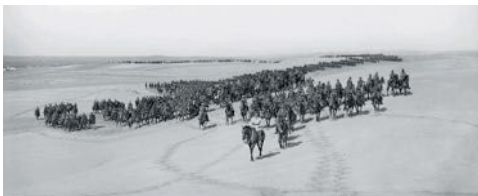
The victorious charge of the Light Brigade at Beersheba, Egypt in 1917; the 4th Light Horse was under the command of Sir Harry Chauvel.

This ride has been an endurance event. At any time there may be between two and a dozen riders and support crew helping out.