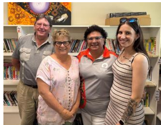
Picture: Members of the Uranquinty Community Committee.