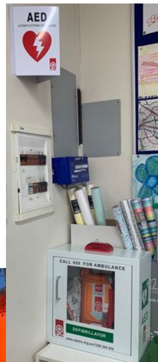
Above left New toilet block of two standard and one disabled/change room. Disable car park adjacent. Centre Shade sails at next to Tennis Club. Full story on page 2. Right The defibrillator (AED) is now installed at the Ampol service station with community training completed on how to use it. Full story on page 1.