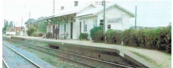
Station in 1980 with station master's cottage in background.