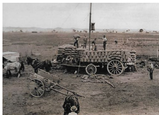
Loading bagged wheat in the early days.

The Uranquinty railway station, originally known as Sandy Creek, was opened on 1 September, 1880 and consisted of a waiting shed and a small ticket office opening at the northern end. The station also acted as a post office as mail was sorted on the mail train and distributed to each station. Local farmers sold fresh produce to the workers and their families and began to send their produce by train