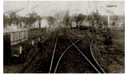
Original station and ticket office, with station on the left facing south.