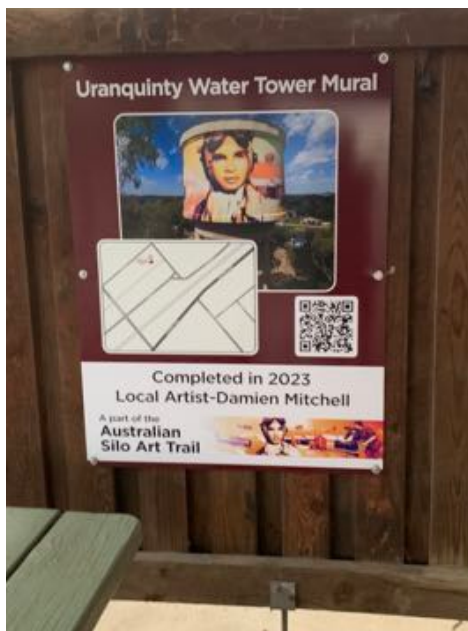
Left: Sign at rest centre; Right: Sign on corner of the main Street and Yarragundry Street; Below: Sign on corner of Best Street and pin on Google Maps.